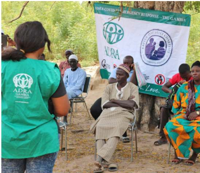
A sensitization meeting before food distribution