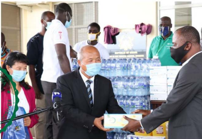
An Adventist businessman handing over his contribution of soya milk (as part of the PPE donation)