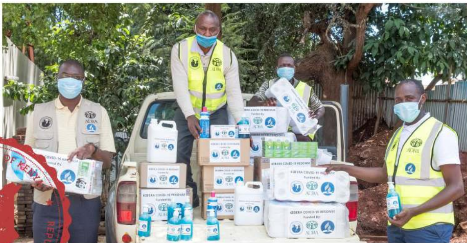
ADRA staff with some of the items before distribution