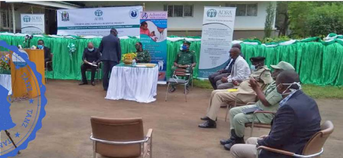
COVID-19 Initial Response launch with stakeholders

10 hand washing facilities installed in public places 30 hand sanitizer dispensers 284 liters of hand sanitizer distributed 800 stakeholders introduced to hand washing