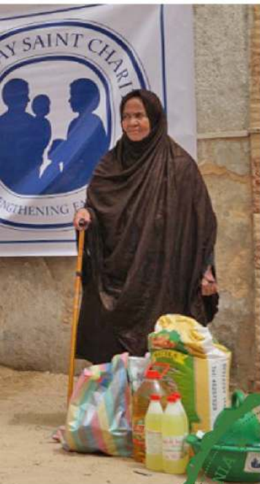
Beneficiary being interviewed by a journalist after a food distribution