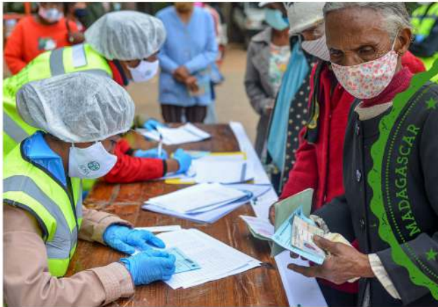
Adventist Youth registering beneficiaries

2,137 beneficiaries received WASH kits (1,091 females, 1,046 males. Of which, 19 households with individuals living with disability and 352 female headed households)