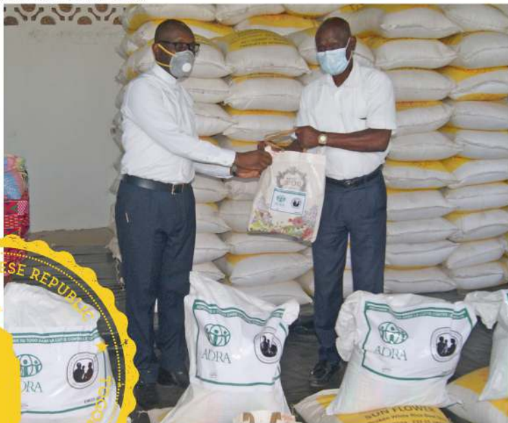
Food distribution launch