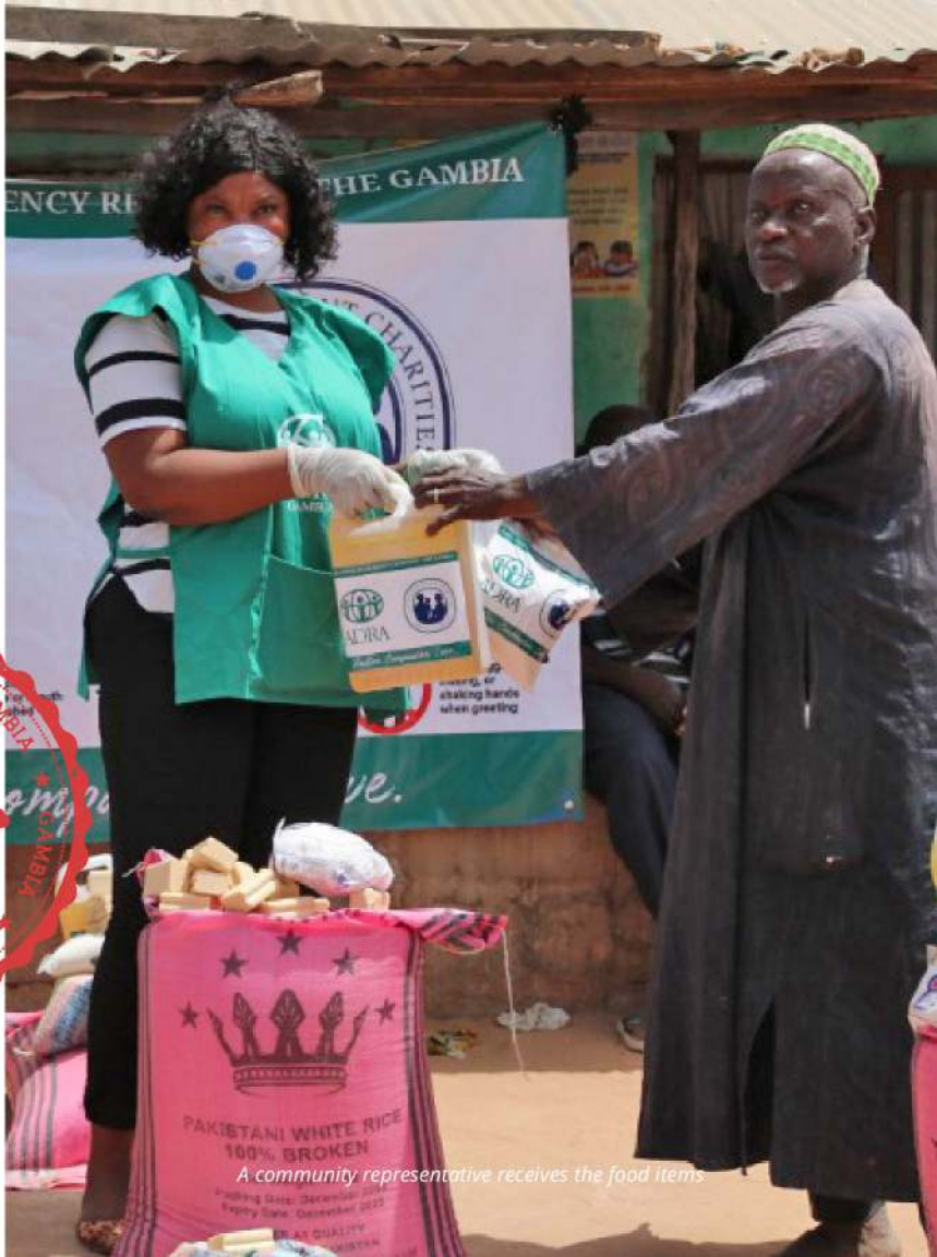
A community representative receives the food items